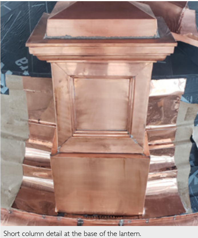
Short column detail at the base of the lantern.