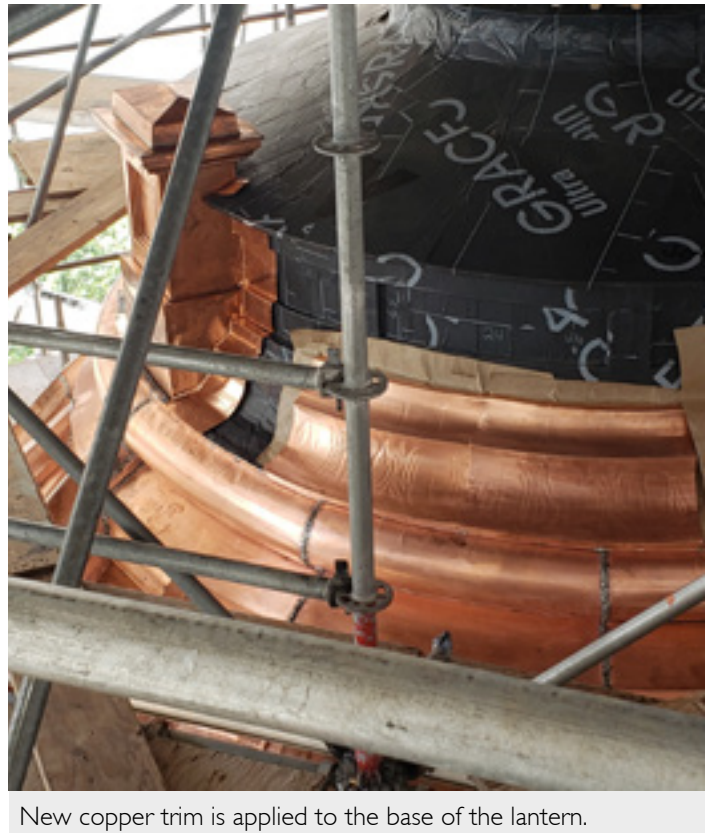
New copper trim is applied to the base of the lantern.