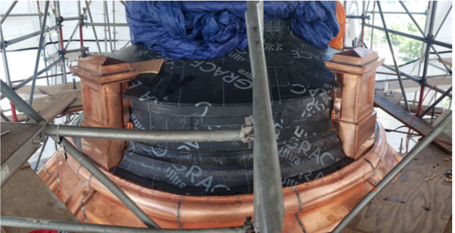
Short columns at the base of the lantern are being set and soldered in place.