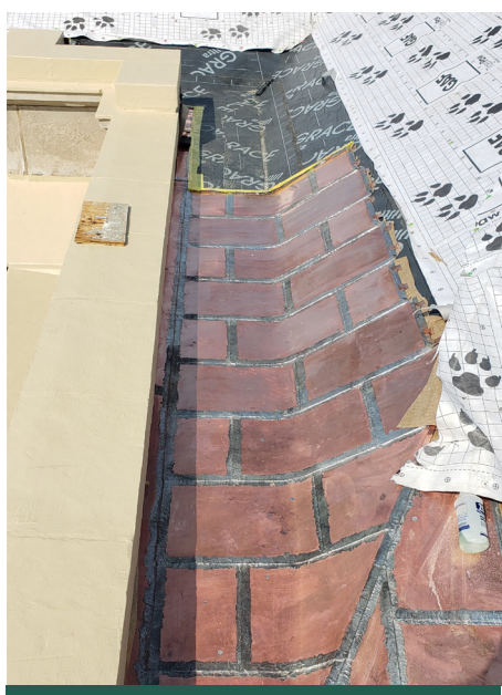
COPPER Soldered copper flat seam areas