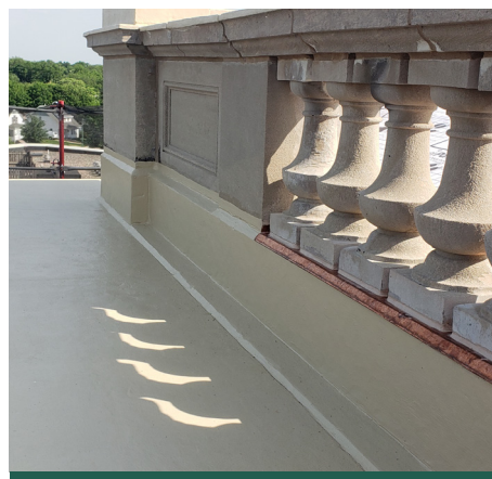
MASONRY Completed masonry and copper through-wall flashing under ballasters located on the building front side