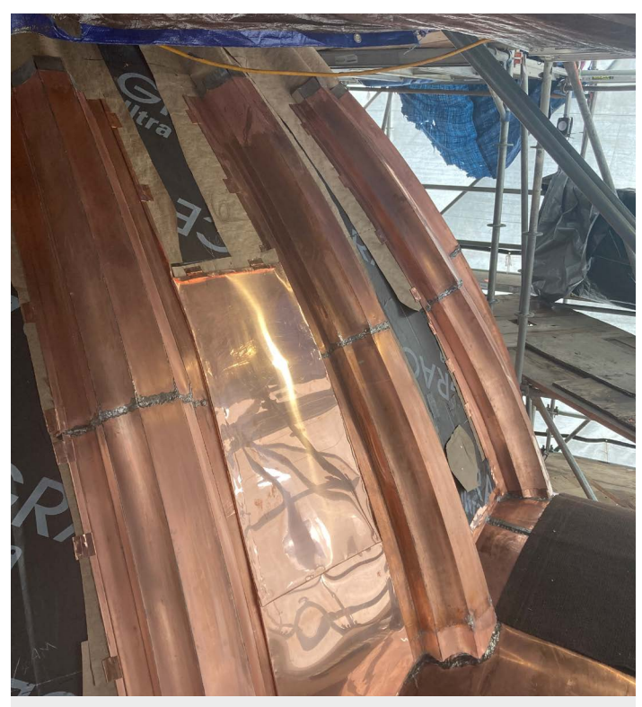
Copper secondary ribs on the dome.