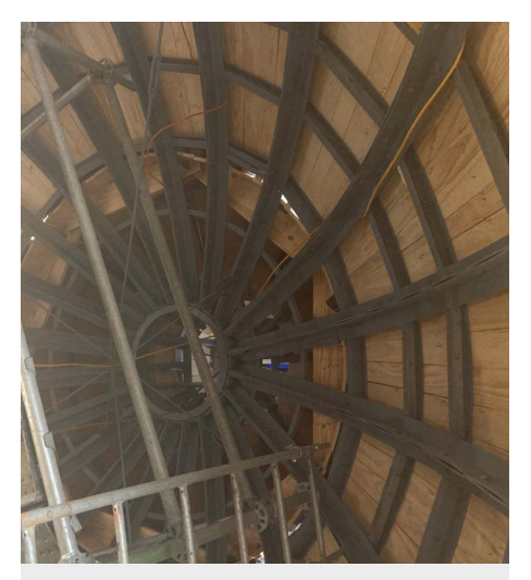
Above: Interior dome framing.