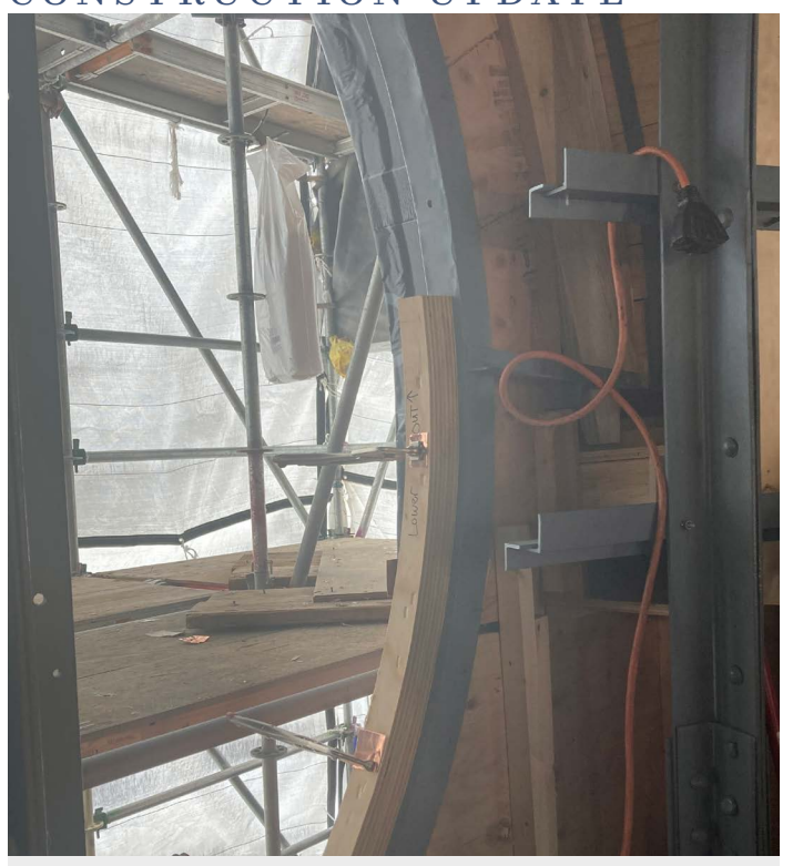
Fitting of the clock dials.