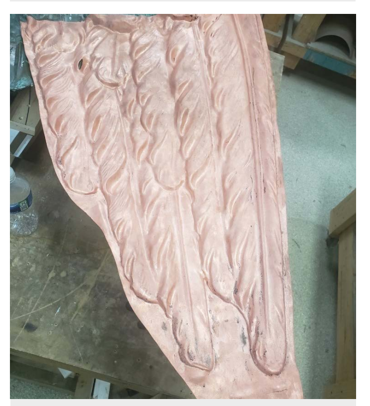
The first copper stamping of the eagle wing portions.