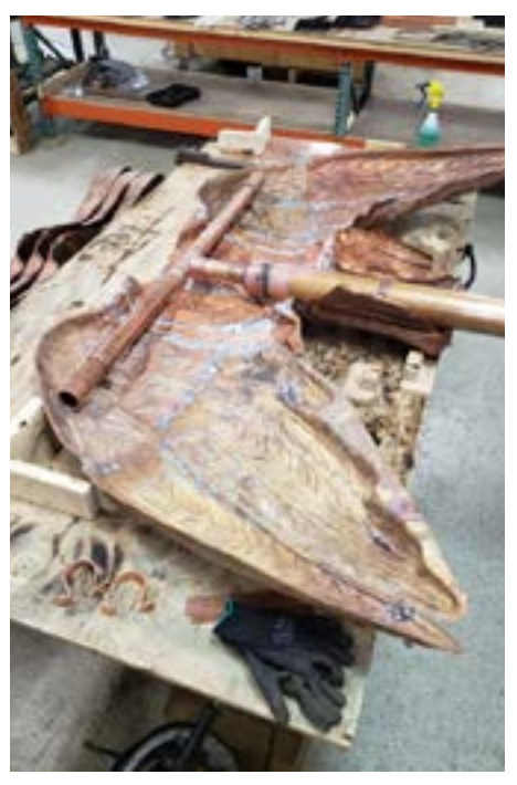
Additional support was incorporated into the new eagles to prevent them from blowing off like two of the previous eagles did.