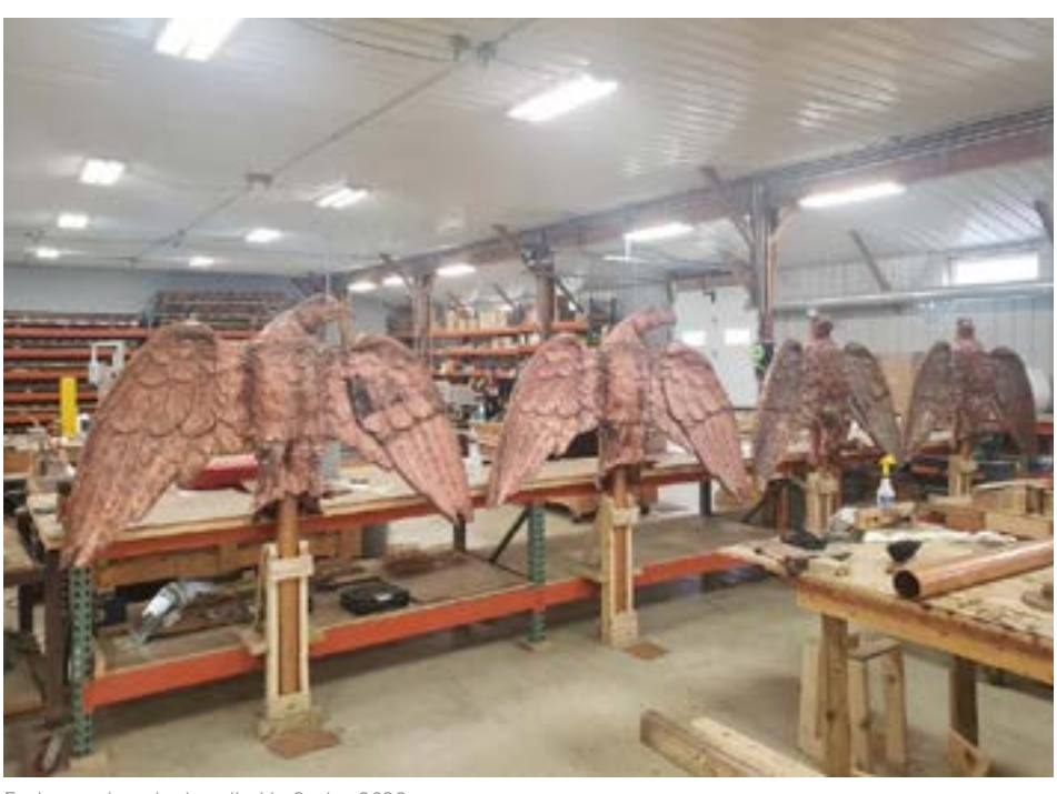
Eagles ready to be installed in Spring 2022.

Roof replacement is now underway. Several challenges were unveiled when the concrete roof deck was discovered to be significantly degraded due to decades of freeze thaw cycles and moisture issues. Solutions include furring channels to fasten roof sheathing to and ultimately the new copper roofing.